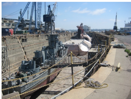
Mighty Midget (LCS-102) and Two Other Vessels in Dry Dock #2

volunteers are accomplishing hull repairs with some quality control assistance from MIDD. Kudos to MIDD for providing a 'helping hand!'