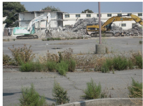
Multiple Barrack Debris Piles