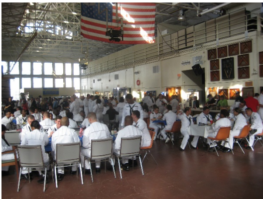
USS EMORY S. LAND Crew Members at the Mare Island Museum Reception

In August 2018, many crewmembers from the LAND joined with the Mare Island Historic Park Foundation volunteers and a team of volunteers from Rebuilding Together Solano County to perform much needed maintenance at the Mare Island Museum and the Quarters A mansion.