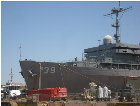
USS EMORY S. LAND at Mare Island - Berths 11 and 12

The Navy's Submarine Tender, USS EMORY S. LAND (AS-39), along with the ship's complement of 250 Navy personnel and 150 Military Sealift Command personnel, arrived at Mare Island from its homeport in Guam in late May for a 100-day repair availability conducted by Mare Island Dry Dock. A warm welcoming celebration was held at the Mare Island Museum—attended by several hundred members of the public—for the LAND crew on May 31, 2018.