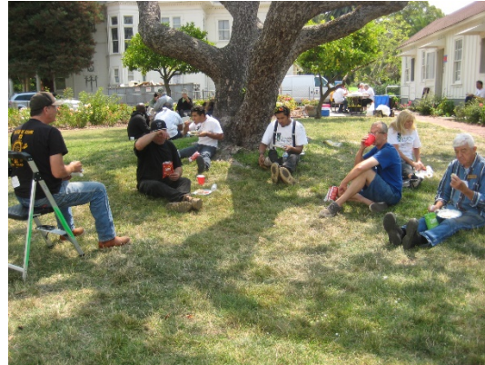
Volunteers from USS LAND and Rebuilding Together Solano County Lunch Break on Grounds of Quarters A

In August 2018, many crewmembers from the LAND joined with the Mare Island Historic Park Foundation volunteers and a team of volunteers from Rebuilding Together Solano County to perform much needed maintenance at the Mare Island Museum and the Quarters A mansion.