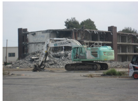
Early Stages of Barrack Demolition

The Navy enlisted barracks—built shortly before the Shipyard closed—are now nothing but piles of rubble. In August 2018, the once modern barracks, located at the corner of "G" (Causeway) Street and Cedar (now-Azuar) Avenue were demolished. Prior to demolition, the vacated barrack structures had become a refuge for transients and had fallen into significant disrepair. Removal of yet another Shipyard eyesore will assist the progress of the Nimitz Group in the development of the North end of the Island.