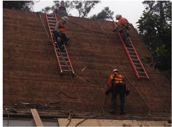
Old Shingles Gone from St. Peter's Chapel Roof

The City of Vallejo is overseeing the installation of the roof being replaced on historic St. Peter's Chapel. Work started on August 20, 2017, and it is expected to complete in late September. As scheduled, the work is being performed after the wedding season and the new roof will replicate the original roof installed on the chapel more than 100 years ago. The following photos were taken approximately half-way through the reroofing project: