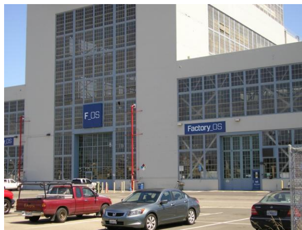
Factory_OS Has Replaced Blu Homes in Building 680

Currently, Factory_OS has a contract with Google to provide 300 affordable housing units for Google’s workforce in the Bay Area. Factory_OS plans to offer as many as 300 well-paying jobs using a labor force comprised of primarily of residents living close by.