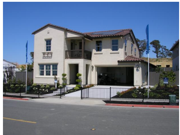
Lennar Model Home at 1530 Flagship Drive

The Lennar Real Estate office is located adjacent to the two model homes located at 1530 and 1534 Flagship Drive.