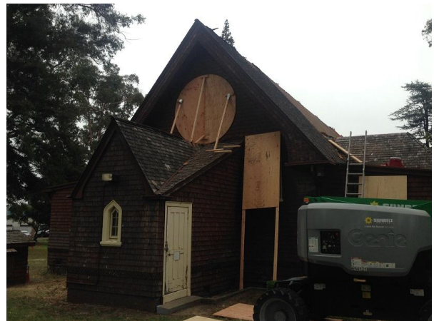
Plywood Covers Protecting Stained Glass Windows