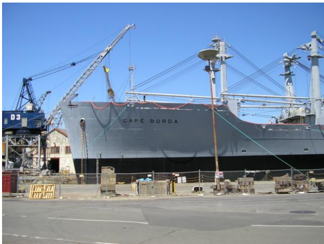
MARAD Ship Cape Borda in Dry Dock 2 – July 2017

Cape Borda entered Dry Dock 2 in late July, immediately following the undocking of Cape Breton. The ship was built in 1967 at Avondale Shipyard in Louisiana and was initially christened as the SS Howell Lykes. The Maritime Administration acquired the ship in 1985 and renamed it Cape Borda. In December 1990, it was placed under operational control of the US Navy's Military Sealift Command and supported Operations Desert Shield/Desert Storm. Cape Borda is the last of the MARAD Ships to depart from Suisun Bay for dismantling.