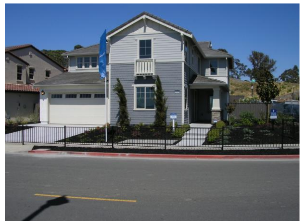
Lennar Model Home at 1534 Flagship Drive