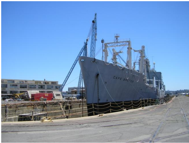
MARAD Ship Cape Breton in Dry Dock 2 – July 2017

Desert Shield/Desert Storm under operational control of the U.S. Navy's Military Sealift Command.